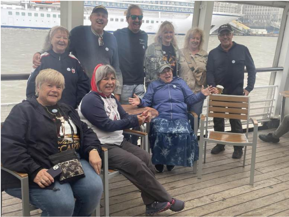
At the dock, we took pictures of and with The Beatles statue there.