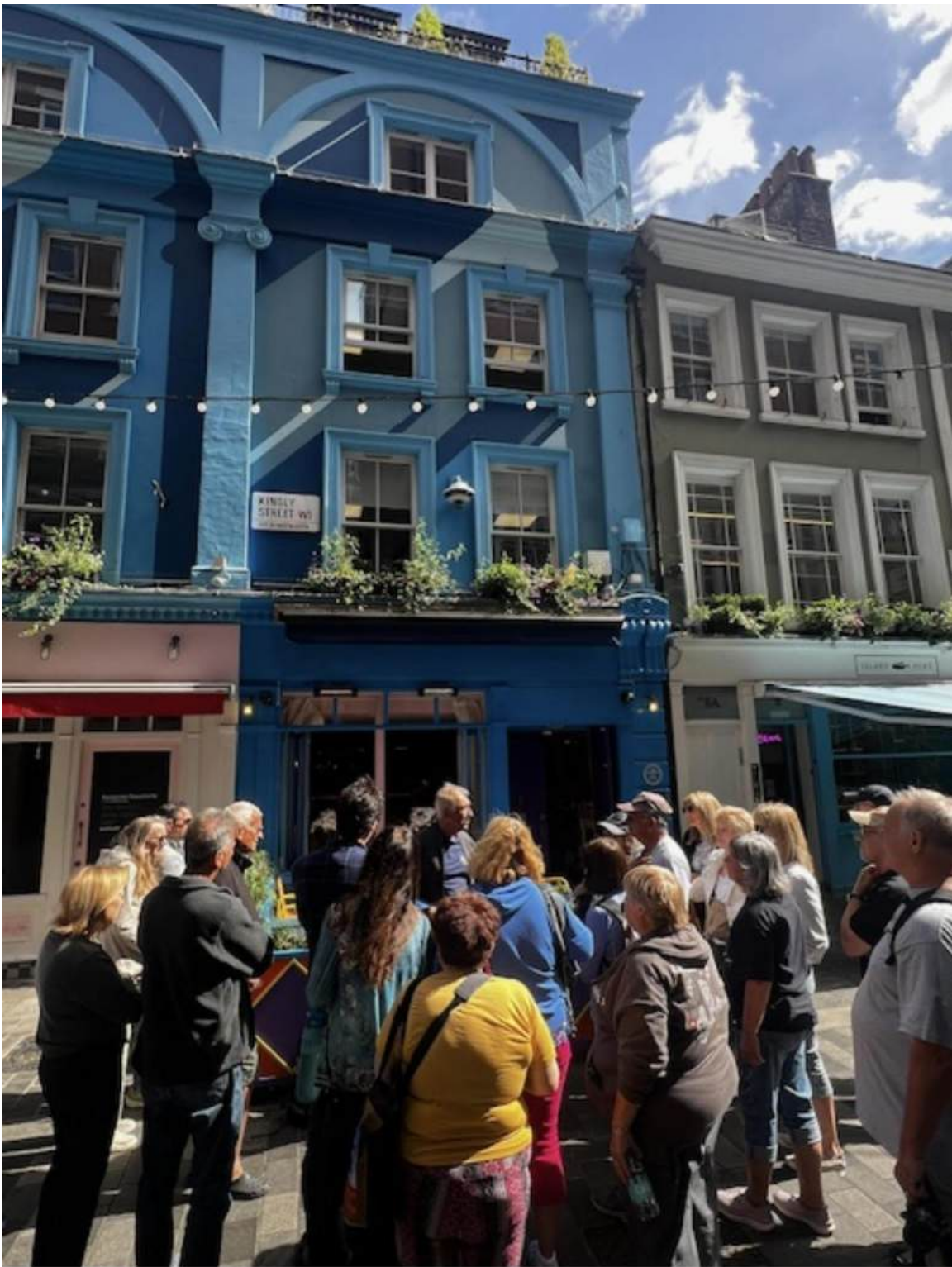
We loved checking out the London Palladium Theater, where many say “Beatlemania” began on October 13, 1963. We learned that Brian Epstein had an office next door.