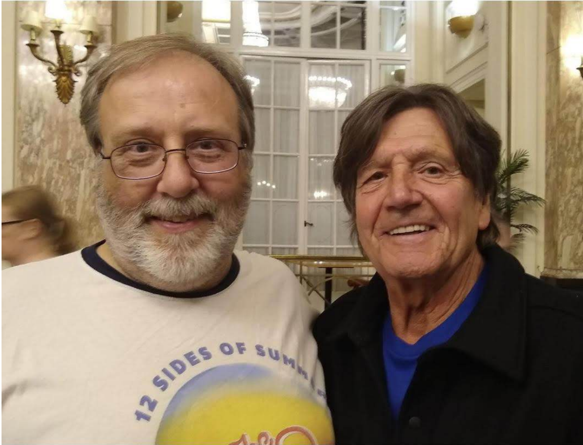
People on our tour got autographs and had their photos taken with some of the many